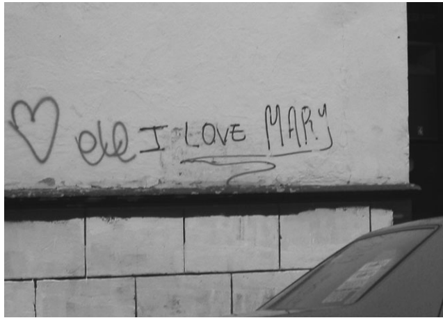
FIGURE 8 English for love: graffiti in English