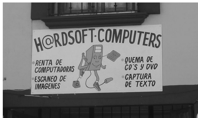
FIGURE 2 Innovative use of English: a small independent computer servicing store

As I looked at what the photos were telling me about my 'why?' question, I realized that the reasons people in Oaxaca use English are connected to the