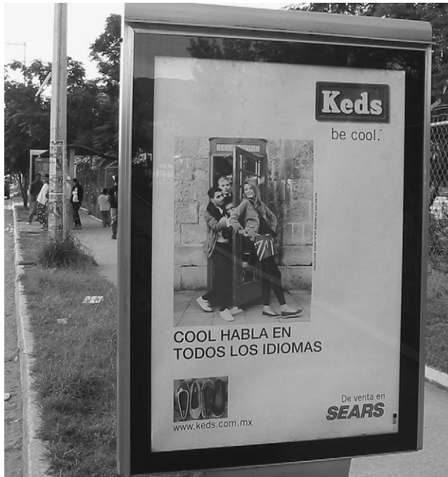
FIGURE 6 English is cool: advertisement on a bus stop