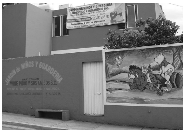
FIGURE 1 Wine the Phoo and Friends preschool

We could interpret the ubiquity of English as part of the phenomenon of linguistic imperialism (Phillipson 1992), and of cultural imperialism as well, since they are often tied with images promoting Western products. Figure 1, for example, shows a preschool whose name— Wine the Phoo —when pronounced as you would in Spanish roughly resembles the