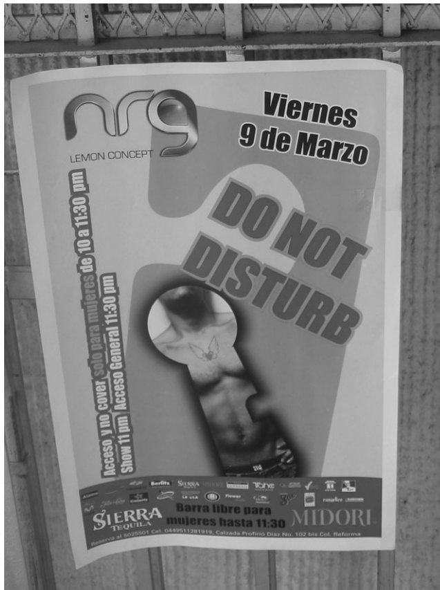
FIGURE 7 English is sex(y): ladies' night at a popular club