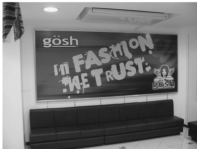
FIGURE 5 English is fashion: a sign in a shoe store

their cars' windscreens, such as 'X-Rated', 'Brown Pride', and 'Devil Driver'. A final subset of this category were the names of the lucha libre or wrestlers that appear on colourful posters announcing upcoming fights that are glued to lampposts, with names like 'AstroBoy', 'Laredo Kid', 'Crazy Boy', 'Los Mexican Power', and 'PathFinder'.