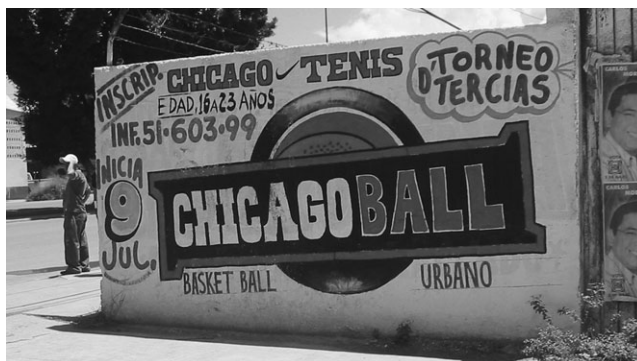
FIGURE 3 Innovative use of English: a local basketball tournament

social value or meaning that English has. Therefore, I decided to focus on the intracultural, innovative uses of English. I identified six themes that explained different social meanings that English has in Oaxaca.