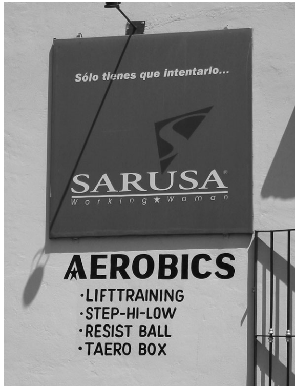
FIGURE 4 English is sophisticated: an upscale fitness centre