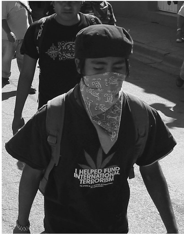
FIGURE 9 English for subversive identity: masked student protestor

resistance—both against the unpopular local governor as well as the United States government and the Iraq war—were in English. Hence, English is a preferred medium for transgressive messages and counter-culture identities.